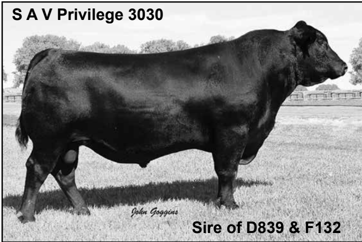
Sire of D839 & F132