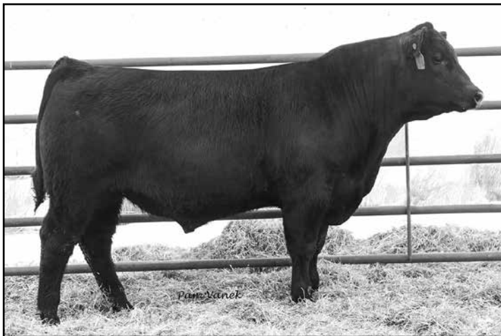
Reference Sire M A R Fortitude 512 Reg: AAA 18312476 Birth Date: 01/19/15

PA Fortitude 2500 GAR-EGL Protege # G G Clara 0171 M A R Lucy 1352 EXAR Upshot 0562B # SJH Lucy 9682 Rito 112 of 2536 Rito 616 # L B 6807 Isabel 339 SydGen C C & 7 # G G Clara 7192 Sitz Upward 307R # EXAR Barbara T020 # G A R Predestined # Basin Lucy 3859