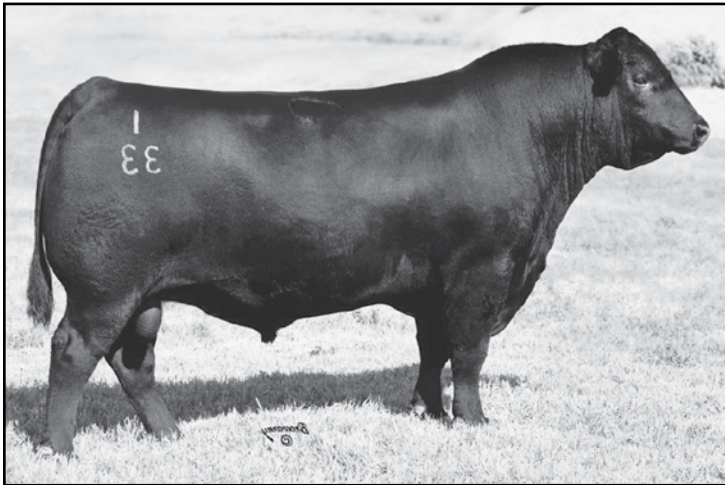
Reference Sire Connealy Black Granite Reg: AAA 17028963 Birth Date: 01/13/11

Connealy Consensus 7229 # Blue Lilly of Conanga 16 S A V Bismarck 5682 # Eura Elga of Conanga 9109 # Eura Cal of Conanga 56B KMK Alliance 6595 187 # Blinda of Conanga 004 Woodhill Admiral 77K # Blue Cash of Conanga 6020 G A R Grid Maker # S A V Abigale 0451 Connealy Black Baron of SCAR Elgina of Conanga 868 232