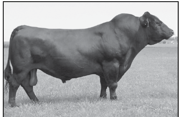
Quaker Hill Rampage 0A36 - Sire of Lots 3, 7, 13, 16, 18, 21, 26, 51-53, 56 & 77