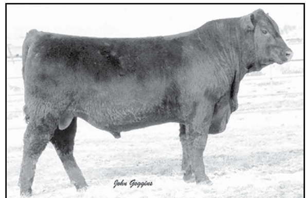
Vermilion Dempsey A061 - Sire of Lots 2, 22, 31, 50, 58-59