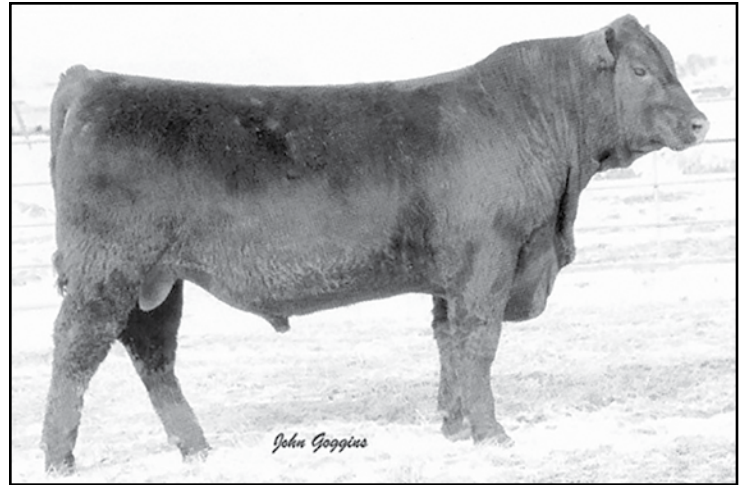
Reference Sire Vermilion Dempsey A061 Reg: AAA 17547303 Birth Date: 01/28/13

Connealy Revenue 7289 FF Dempsey Y11 S Chisum 6175 # Vermilion Eulima 1244 Vermilion Eulima 5480 # S A V Net Worth 4200 # Hyannis of Conanga 577 # S A V Final Answer 0035 # FF Fanny T35 S Alliance 3313 S Gloria 464 # Vermilion Dateline 7078 # Vermilion Eulima 9270