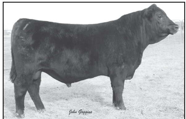
Vermilion Spur B143 - Sire of Lots 1, 6, 14, 15, 25, 30, 35, 42, 55, 57 & 75