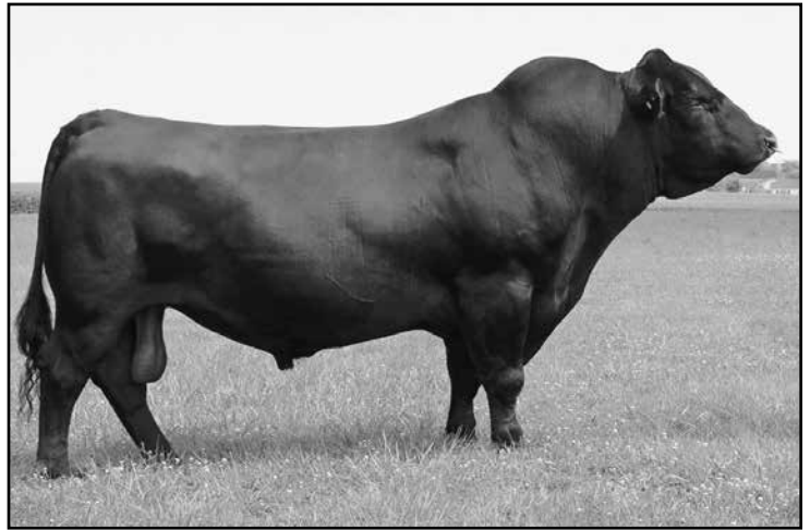
Reference Sire Quaker Hill Rampage OA36 Reg: AAA +*16925771 Birth Date: 09/11/10

Boyd New Day 8005 # MCC Daybreak # MCC Miss Focus 134 # Ideal 4355 of 0T26 2440 QHF Blackcap 6E2 of 4V16 4355 QHF Blackcap 4V16 of 1H8 A A R New Trend # S V F Forever Lady 57D S A F Focus of E R # M C C Miss Chief 519 S S Objective T510 0T26 # Ideal 2440 of 7407 7275 Rito 2V1 of 2536 1407 # Quaker Hill Blackcap 1H8