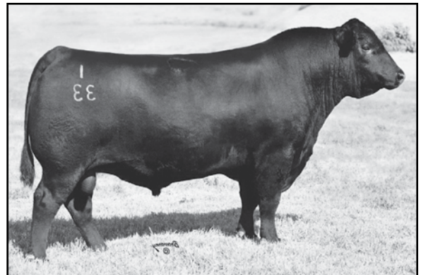
Connealy Black Granite - Sire of Lots 12, 17, 28, 38, 64 & 68