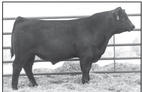
M A R Fortitude 512 - Sire of Lots 5, 34, 36, 40, 45-49, 60, 65 & 71