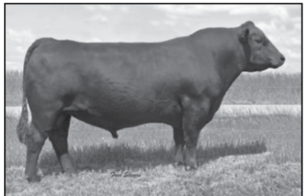
K C F Bennett Southside - Sire of Lots 9 & 32