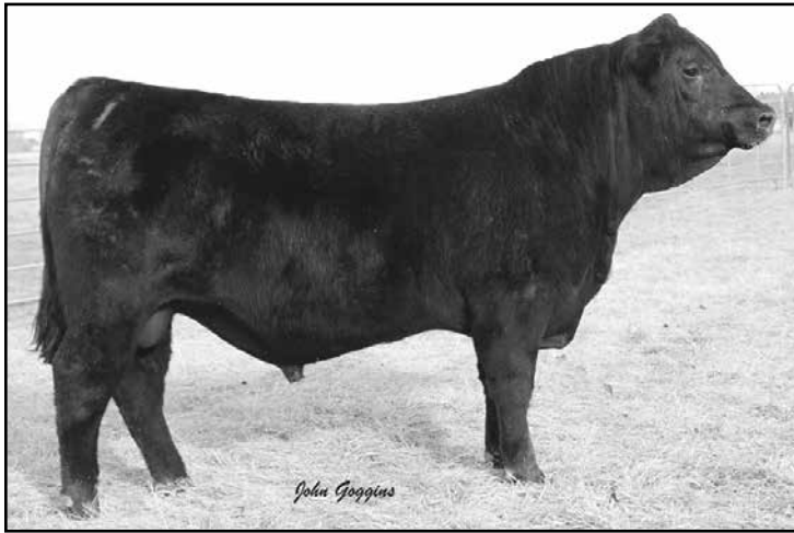
Reference Sire Vermilion Spur B143 Reg: AAA 17841933 Birth Date: 02/12/14

Connealy Stimulus 8419 # Connealy Spur Jazza of Conanga 8594 # Connealy Dublin 8223 # Vermilion Pattie 1117 # Vermilion Pattie 8114 # H A Power Alliance 1025 # Black Creesa of Conanga 5332 TC Grid Topper 355 # Jemma of Conanga 5614 Connealy Full Freight Black Rina of Conanga 69 HARB Onward 786 J H # Vermilion Pattie 5414